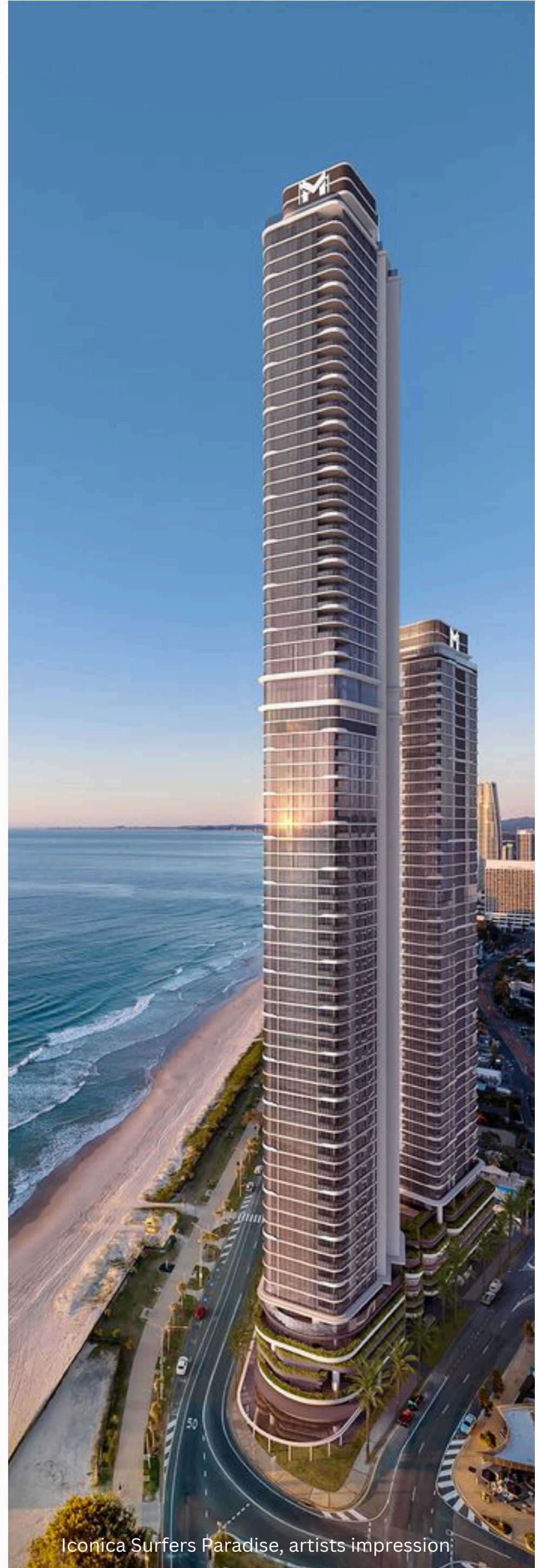
Iconica Surfers Paradise, artists impression